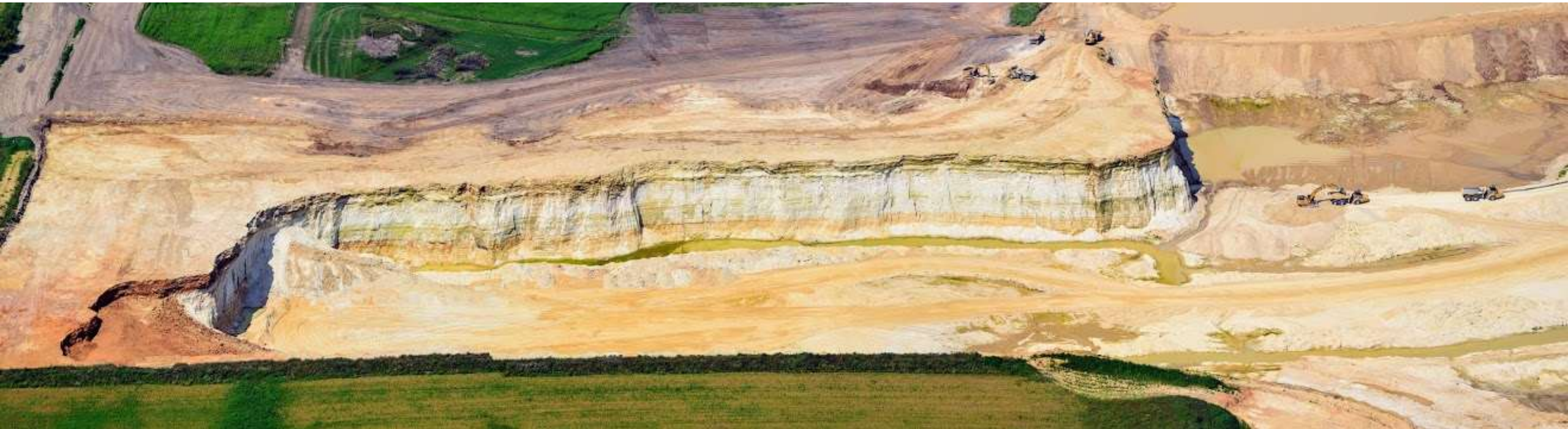
Hi-Crush mine in Bridge Creek, Eau Claire County.