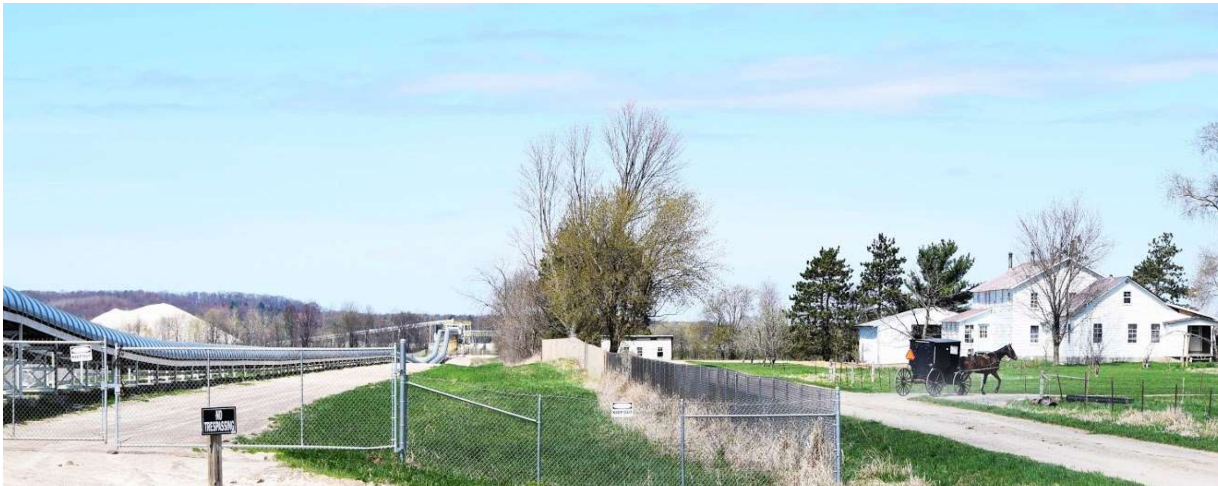
Hi Crush Augusta, WI frac sand conveyor.