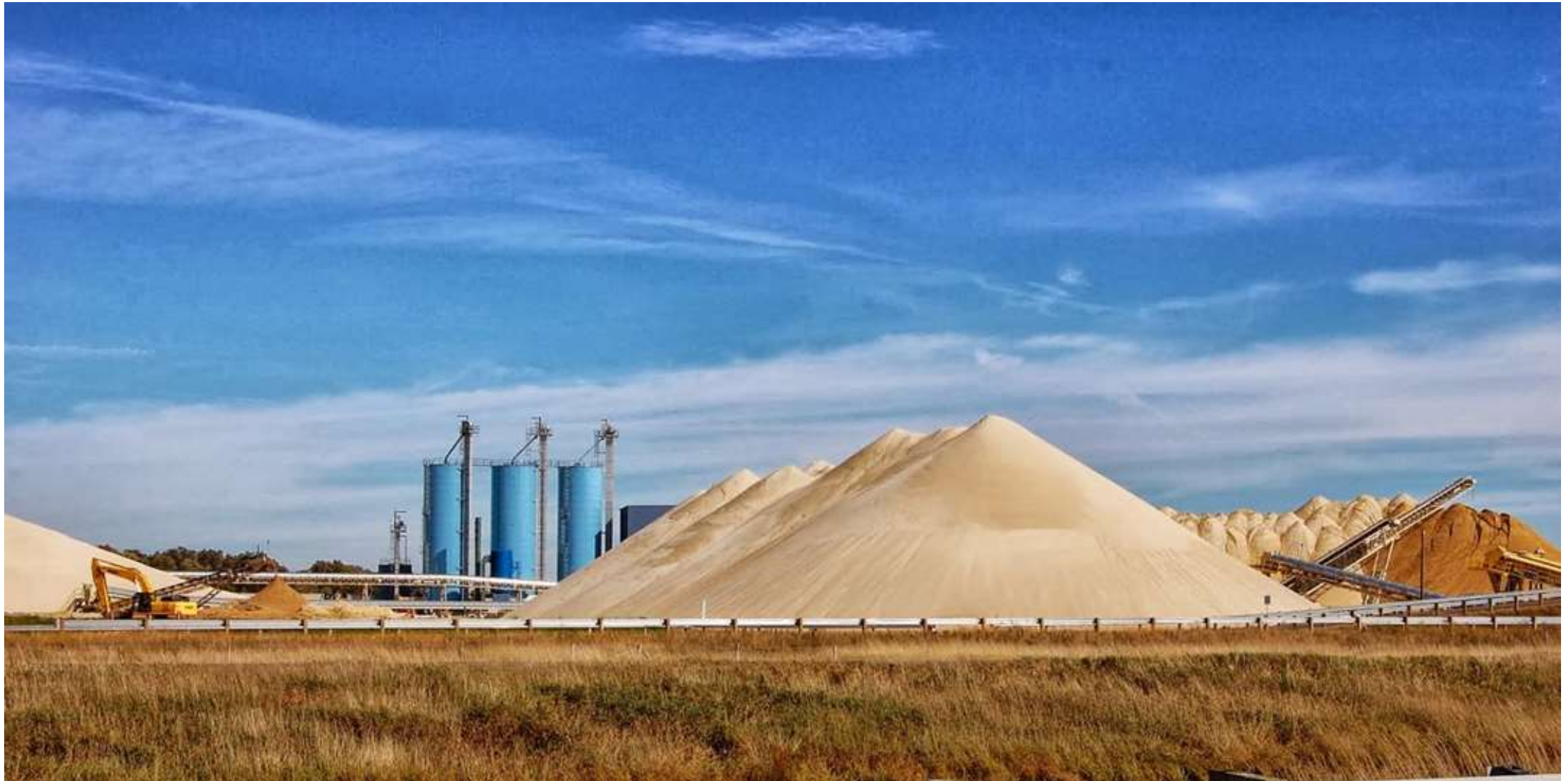
October 2013