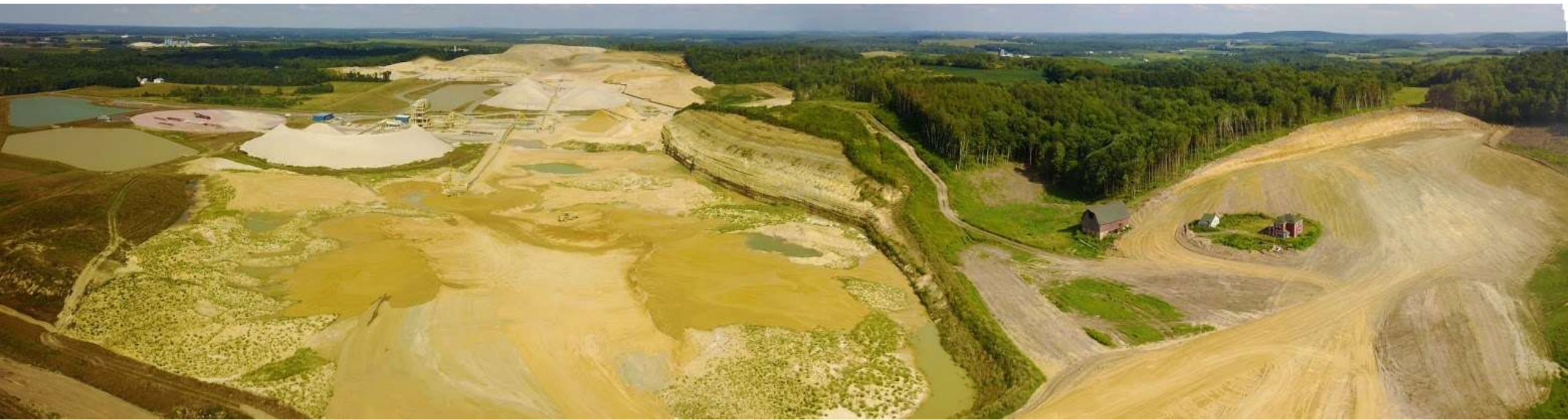
Frac sand mine in Dovre, WI operated by Great Northern